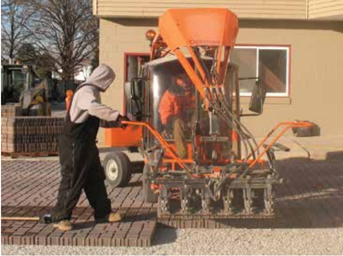
Installation of porous pavers at the Energy Exchange in Milwaukee, WI (November 2009).

Extensive research by the U.S. Forest Service demonstrates that something as simple as trees can reduce building energy consumption for cooling in the summer and, depending on factors such as climatic region, size, tree type and the location of the tree, can also reduce heating costs in the winter. For example, based on Forest Service models for the Midwest region, a single large tree can generate nearly $45 in energy savings annually; multiplied by numerous tree plantings on a commercial property, annual savings can easily total hundreds of dollars per year.