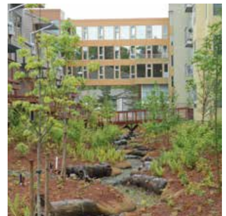
Apartment complex at Headwaters at Tyron Creek, in Portland, Oregon.