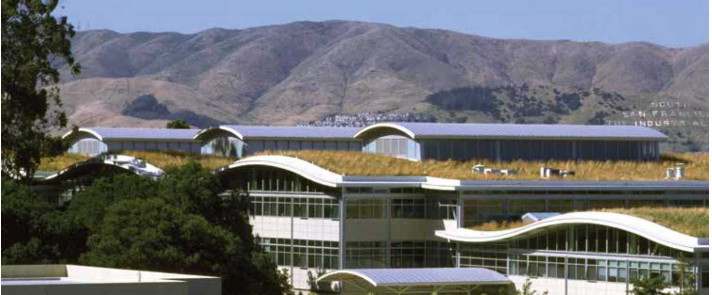
A green roof on the offices of YouTube in San Bruno, California.