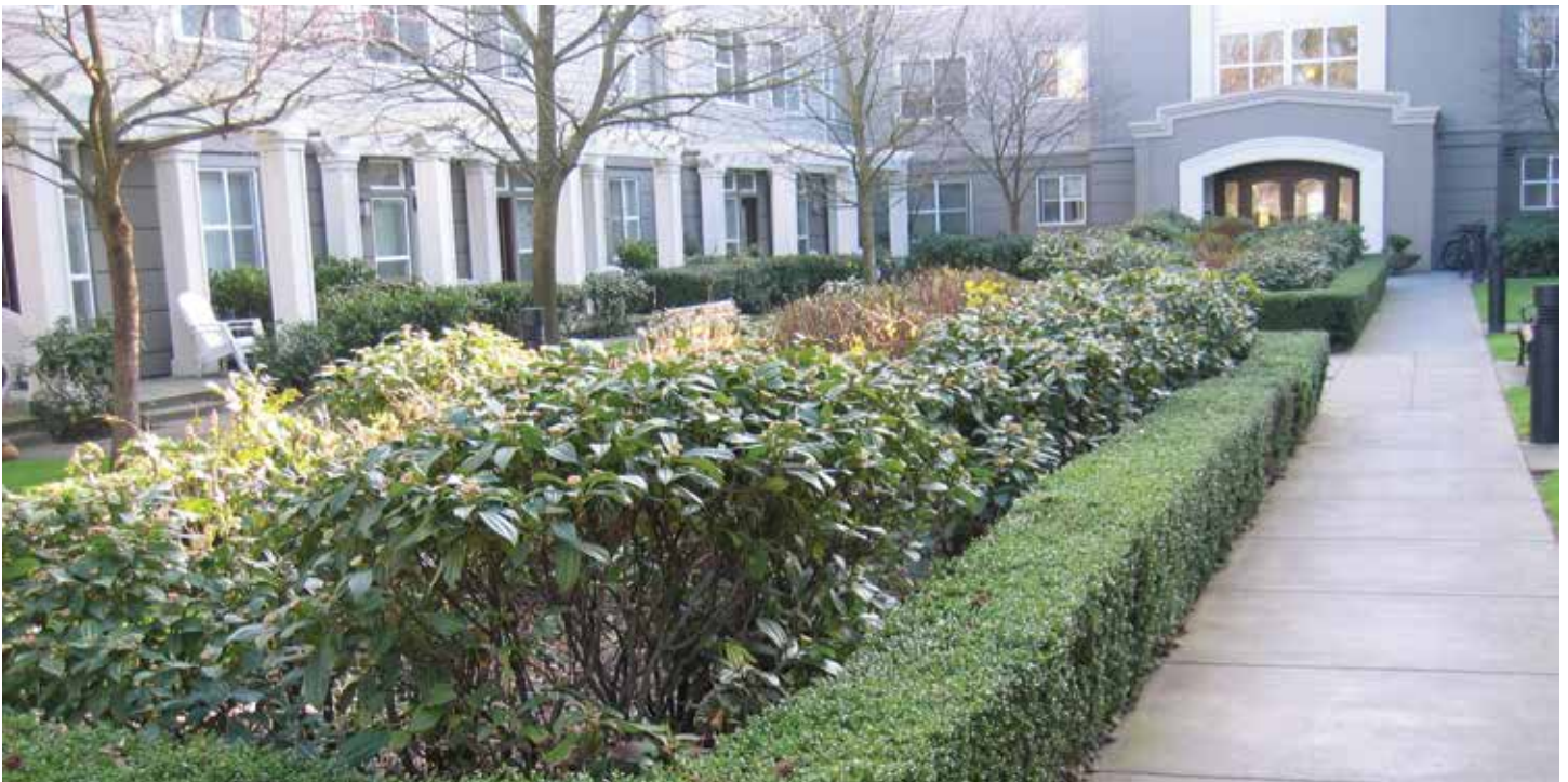
Buckman Heights Apartments, Portland, OR.

© Hawkins Partners, Landscape Architects, www.hawkinspartners.com