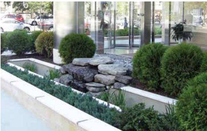
Commercial office building at 1050 K Street, Washington, D.C.

A note on methodology: The following examples are based on findings from published research and some basic assumptions. For building and property characteristics, we relied on data from the Department of Energy's commercial building benchmark specifications and other online data sources, or made reasonable assumptions. To estimate the potential benefits of green infrastructure for each building type, we applied findings from the literature and/or relied on existing models.