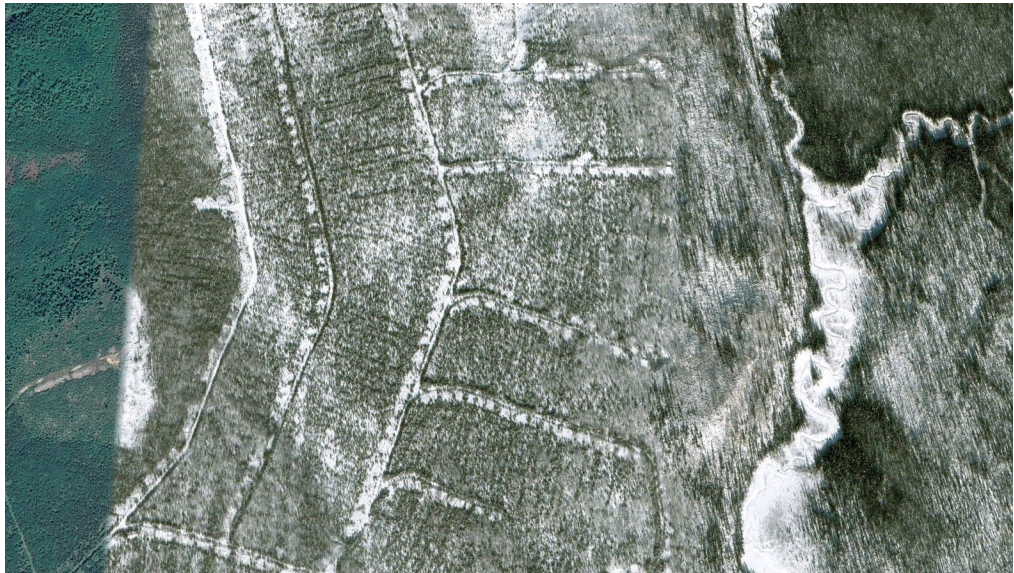
Logging scars from a clearcut from 1989, with scars covering approximately 13% of the clearcut area. Credit: © Google Earth, with original site documentation from Trevor Hesselink, Wildlands League

When assembled, the government's data paints a clear picture of the logging industry's climate footprint, which should be addressed in the government's climate strategy. However, it should be noted that the net logging emissions, as calculated above, likely understate the industry's full climate impact. Government data omit a number of factors essential to a comprehensive emissions profile. For example, the calculations above are based on logging data from provinces and territories, which recent whistleblower testimony has called into question. 18 The government's inventory also excludes key forest and logging dynamics essential to a comprehensive emissions calculation. For example, the government does not include the carbon impact of "logging scars," areas where the forest remains essentially barren even 20 to 30 years following logging. 19 It also does not include non-CO 2 GHG emissions from logging, such as methane. 20