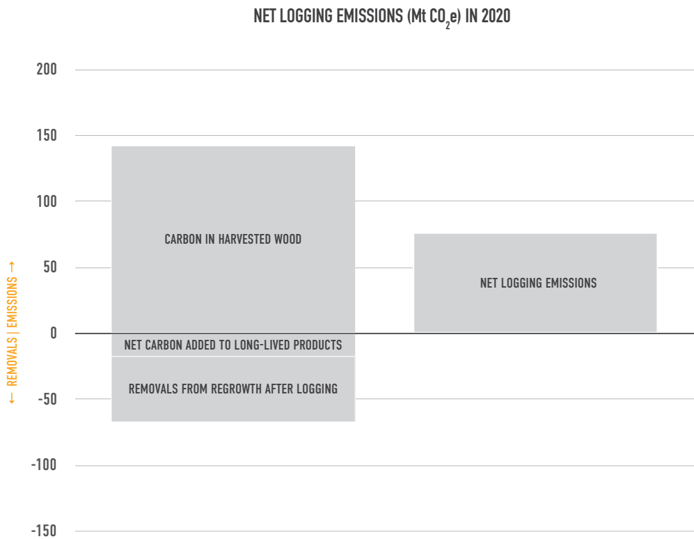
Figure 1: Canada’s 2020 net logging emissions. The left column depicts emissions and removals associated with logging (emissions are positive, removals are negative). The right column depicts the net (sum of) emissions and removals in the left column, showing logging as a large net source of emissions in 2020.

According to the above calculations, using the government’s own data, Canada’s logging industry is a high-emitting sector. In 2020, the logging sector emitted 75 megatonnes of carbon dioxide equivalent (Mt CO 2 e), which is equal to more than 10 percent of Canada’s total GHG emissions (see Figure 1). 15 In fact, net logging emissions in Canada were higher than emissions from oil sands operations in every year from 2005 to 2018 (the average annual net emissions of logging were 82 Mt CO 2 e between 2015 and 2020, while the average annual emissions of oil sands production were 78 Mt CO 2 e over that same period — see Figure 2).