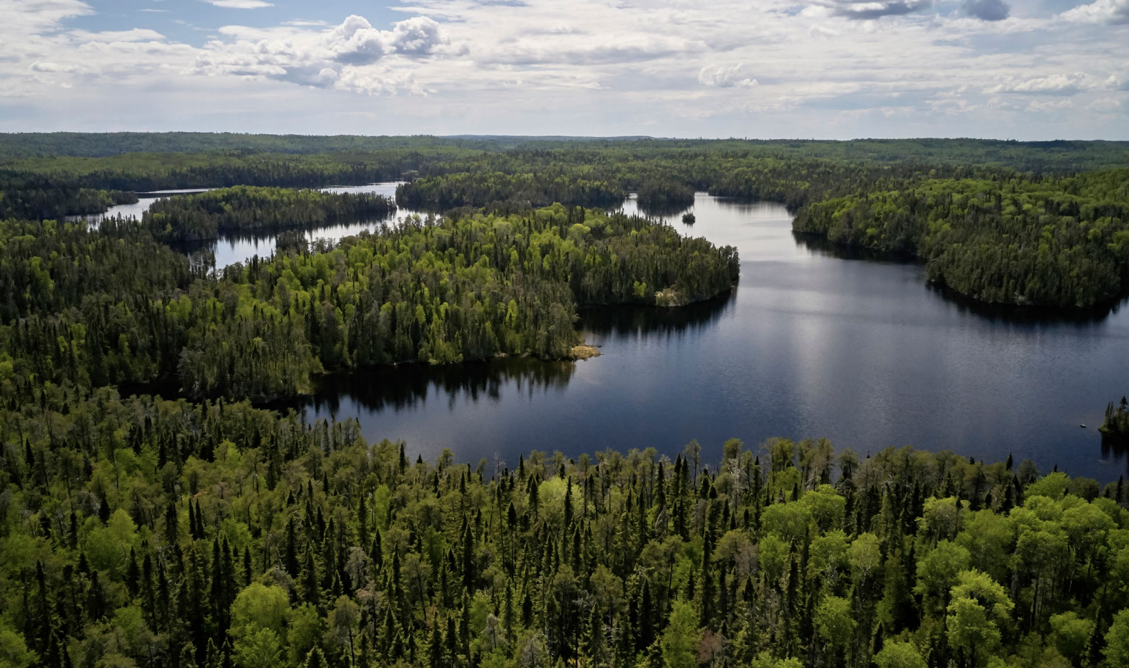
Boreal forest in Ontario