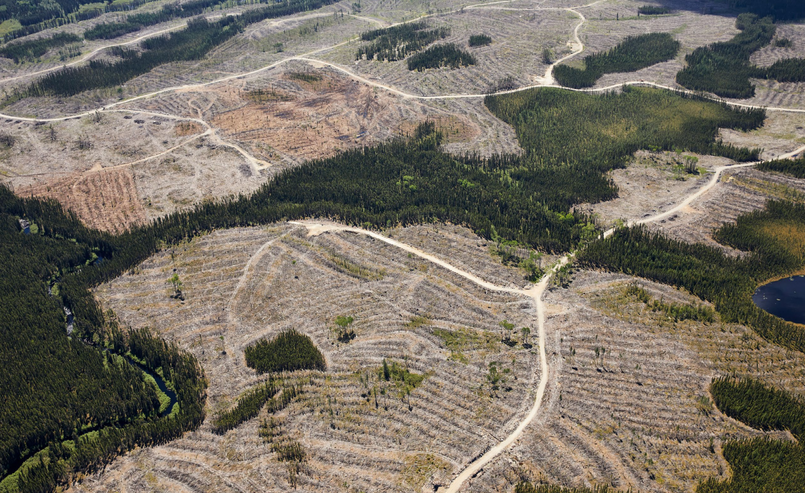
Clearcut in Ontario

Despite having some of the most carbon-dense and expansive primary forests in the world, 11 as well as one of the largest logging industries, Canada is failing to transparently report the net GHG emissions from its net logging emissions. Within its annual GHG reporting to the United Nations and its 2030 ERP, 12 Canada discloses its net emissions from all other high-emitting sectors, but does not report any such figure for industrial logging.